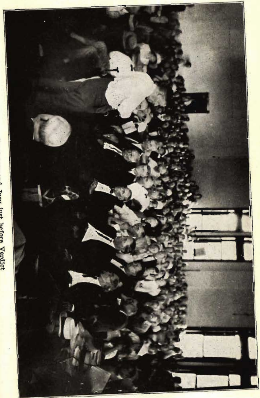
Courtroom and Jury just before Verdict